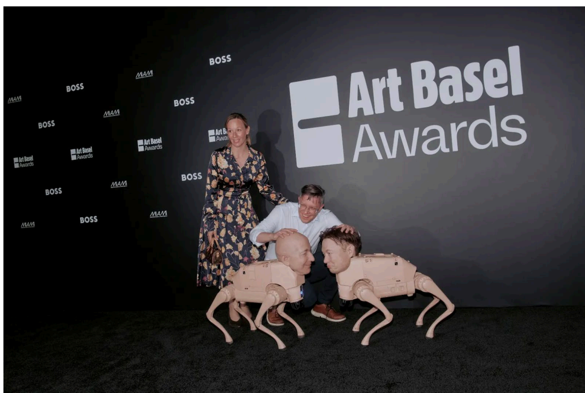
Mike Winkelmann ("Beeple") with two components of his work Regular Animals (2025) arriving at the step-and-repeat, December 4, 2025.