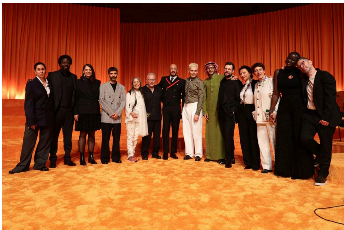
Art Basel Awards 2025 Gold Awardees and BOSS Award for Outstanding Achievement winner pose with ceremony host, Swizz Beats at the Awards Night in Miami Beach, December 4, 2025.