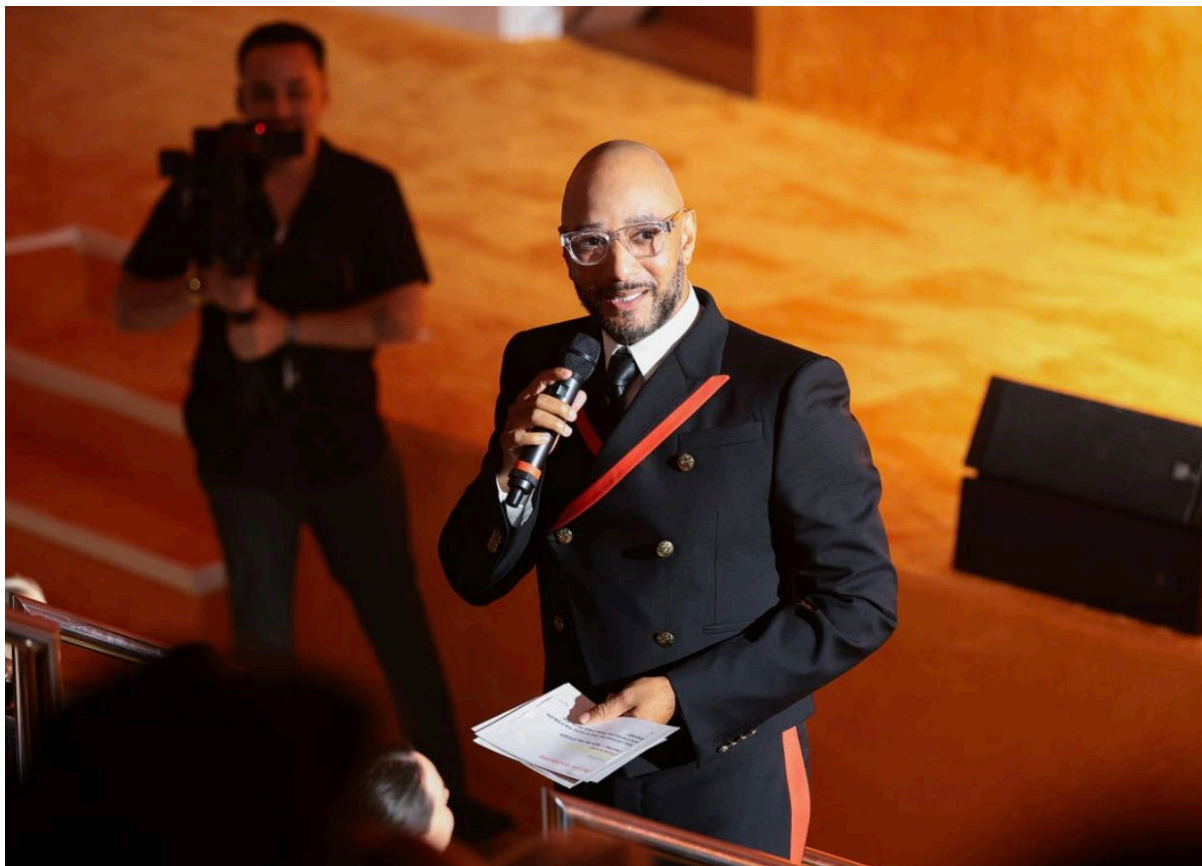
Swizz Beatz hosted the inaugural Art Basel Awards Night in Miami Beach, December 4, 2025.