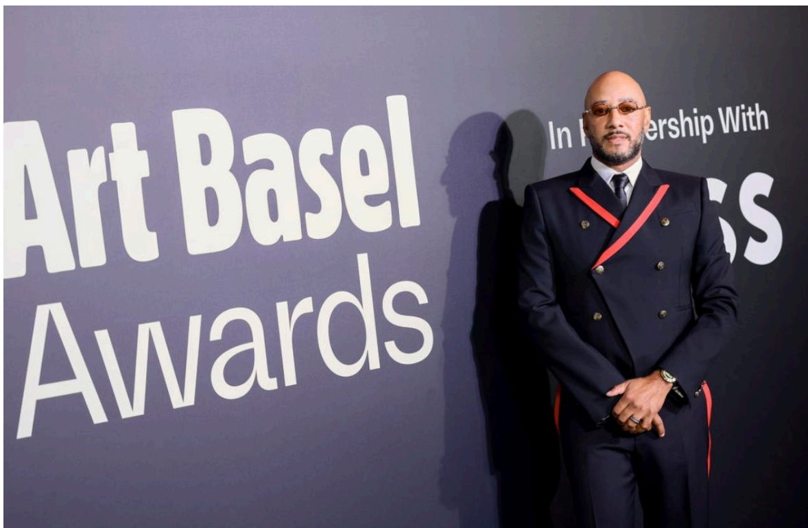
Swizz Beatz captured on the black carpet at the Art Basel Awards Night in Miami Beach, December 4, 2025.