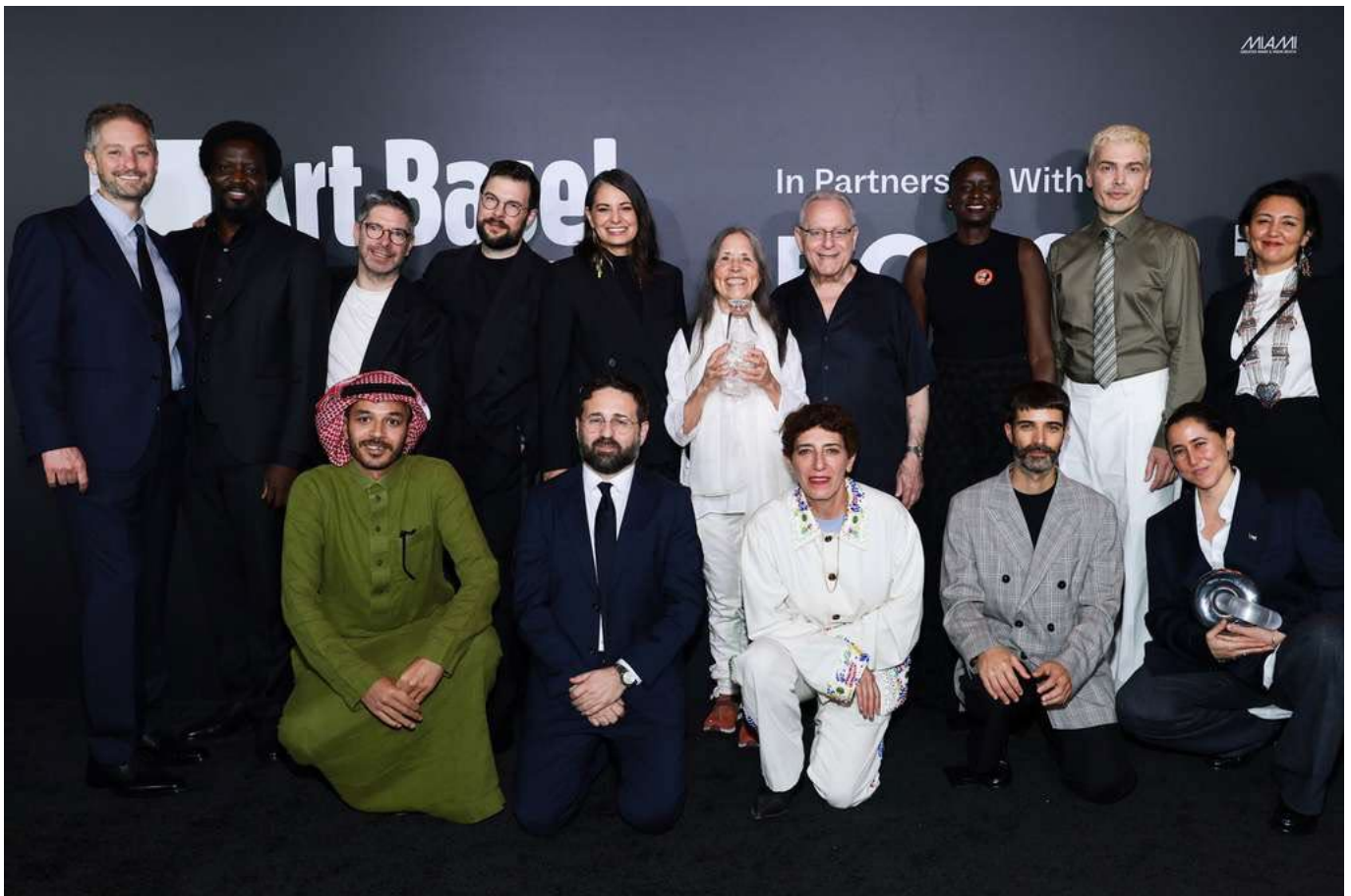
Art Basel Awards 2025 Gold Awardees and BOSS Award for Outstanding Achievement winner gather at the Awards Night in Miami Beach, December 4, 2025.

Presented in partnership with BOSS, the landmark gathering brought together global leaders in contemporary culture for a multisensory celebration at the New World Center